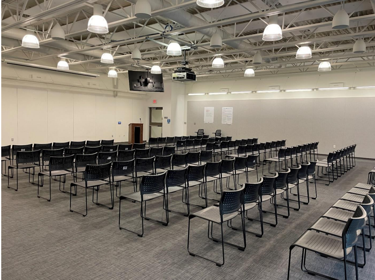
Image Description: Inside Arch 104, set up with black, portable chairs arranged in rows facing a lecture podium.