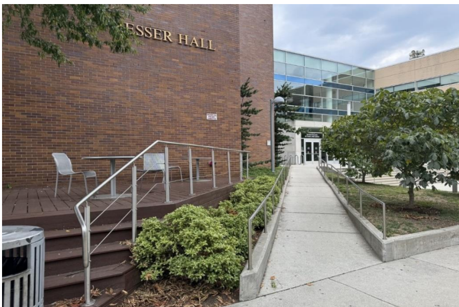
Image Description: The main entrance to Tyler, showing a brick building with a staircase and trees next to a ramp entrance leading up to Tyler building.

Image Description: The Tyler School of Art and Architecture building featuring glass windows and two entry/exit doors. It also includes stairs and a cloudy sky in the background.