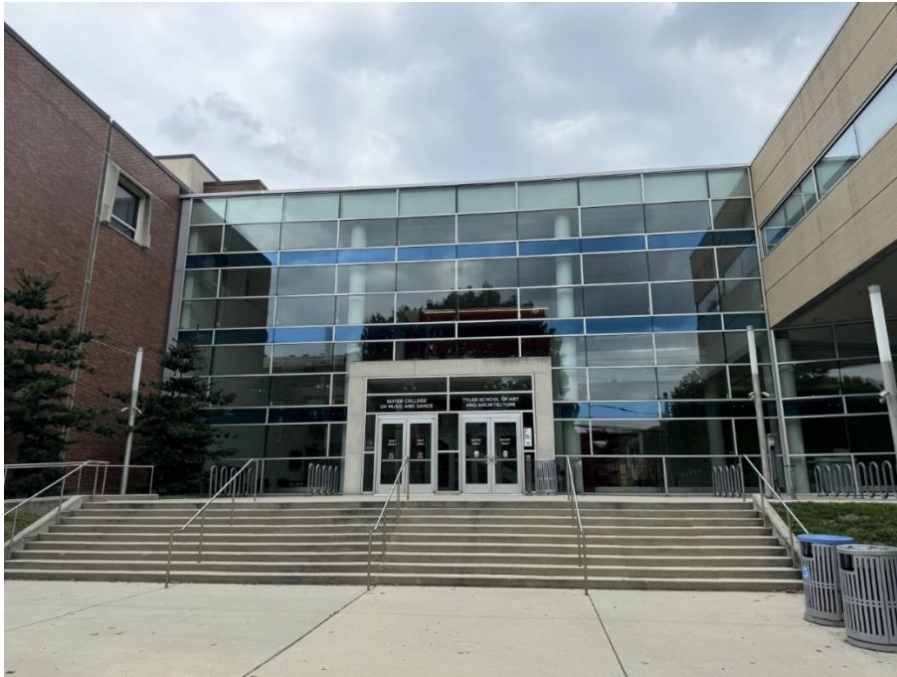
Image Description: The Tyler School of Art and Architecture building featuring glass windows and two entry/exit doors. It also includes stairs and a cloudy sky in the background.

The Norris Street entrance to Tyler is considered the main entrance and is on Norris Street between 12th and 13th Streets . Entering on the Norris Street, there is a ramp for easy access on the left side of the entrance (closer to 13 th St.) Once in front of doors there is an access button to press and the first doors will open, once inside, there is another access button to press to open the second set of doors.