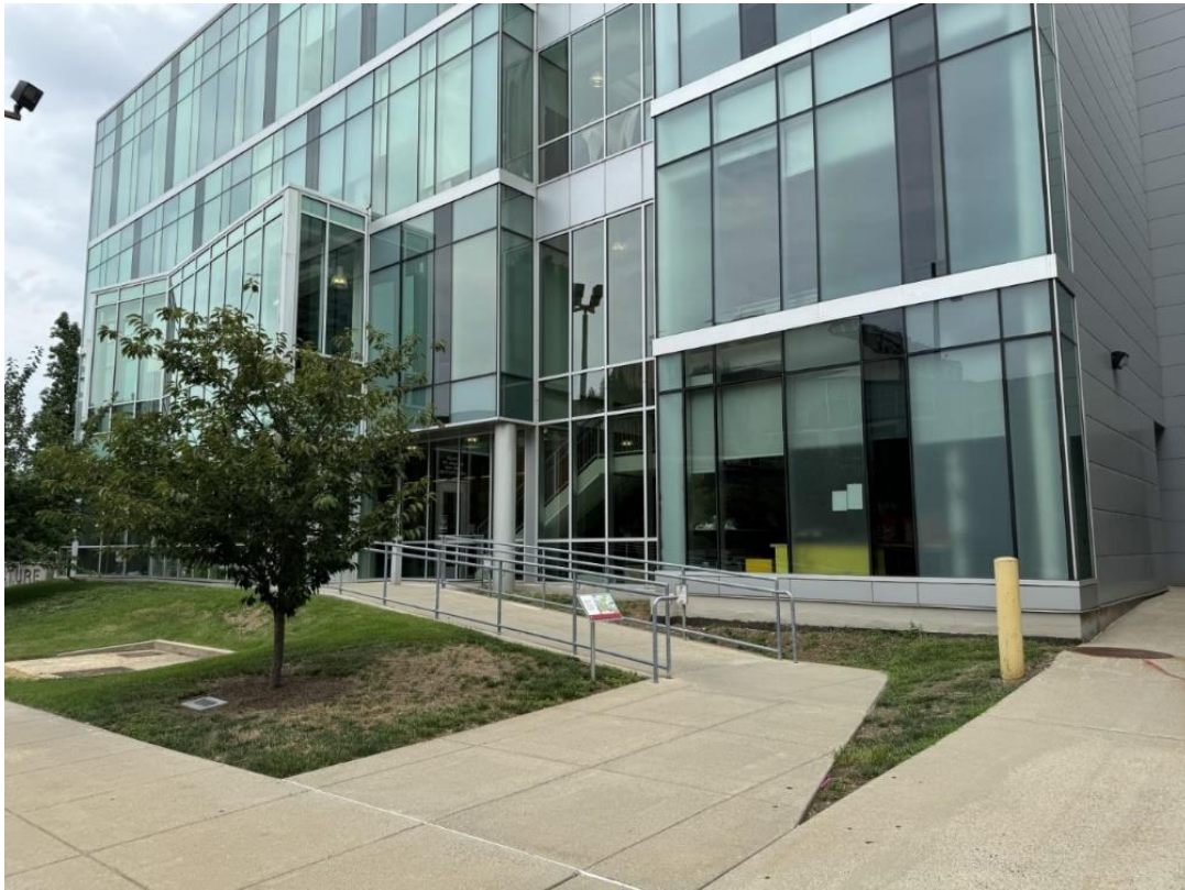
Image Description: The 13 th Street entrance to Tyler, a building with glass windows. It features an outdoor setting with a clear view of the sky and some plants around the building, there is a cement ramp leading up to the building entrance.

The 13 th Street entrance to Tyler is at 2001 N 13 th Street (between Norris & Diamond Streets). Access via ramp on the right side, once at the door there is an access button to press that opens both the inside and outside doors. This entrance is closest to the event space inside the building and may be preferred for guests who prefer a shorter route to the event space.