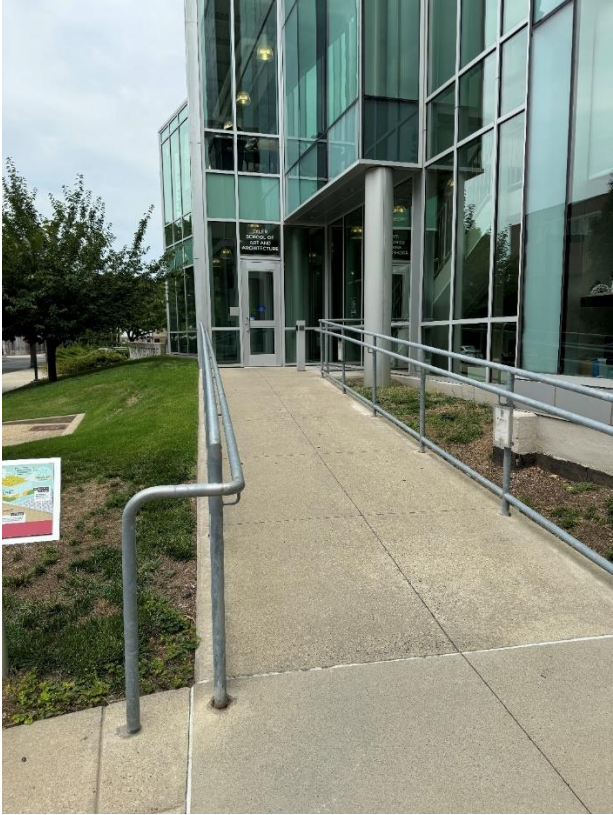
Image Description: A concrete access ramp leads upward towards the building entrance. The entrance is a glass door with an automatic button to the right side at the top of the ramp.