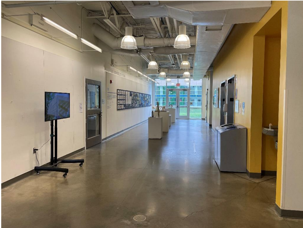
Image Description: Hallway inside Tyler, the left wall side is white while the right wall side is yellow, the white wall is leading to Arch 104 on the left.