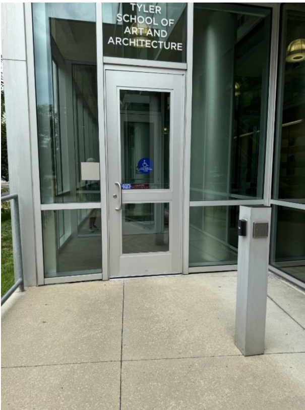
Image Description: A glass door with a sign above it. The sign reads "Tyler School of Art and Architecture". There is an automatic door button to open the door, and the door opens towards the exterior.

Image Description: A concrete access ramp leads upward towards the building entrance. The entrance is a glass door with an automatic button to the right side at the top of the ramp.