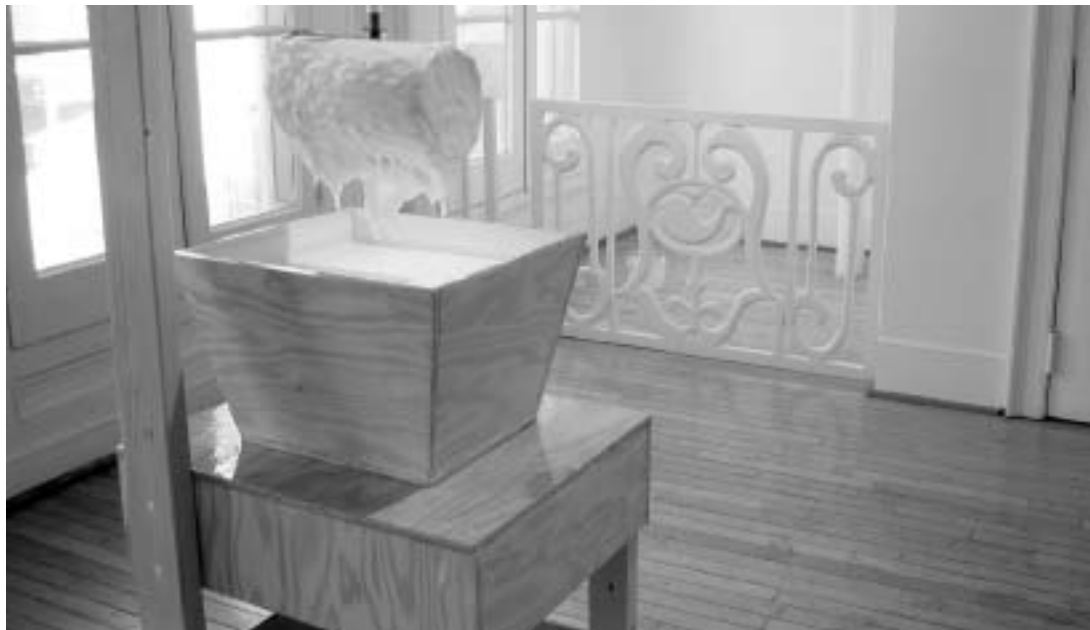
Emily Blaskovich ('05), MFA Thesis Exhibition, April 2005

Tyler Summer Workshop Deadline to register is June 15, 2006. Contact Tyler.Conted@temple.edu or 215.782.2760.