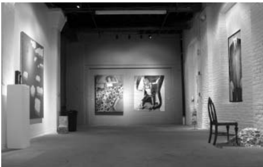
Original artwork for the banners on view at the Tower Gallery