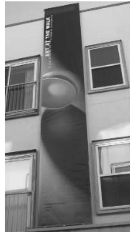
April 2006: The banners are installed

For more information on the shops and eateries at Liberties Walk, visit www.towerdev.com/merchants.html .