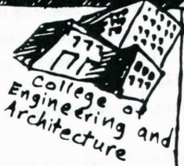
College of Engineering and Architecture