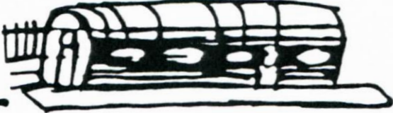
SEPTA Regional Rail Temple University Station