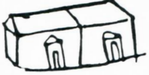
Regional Rail Ticket office